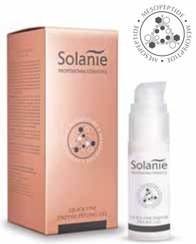
SO11200 • Solanie Quick Fine Enzyme Peeling Gel 30 ml

By using Quick Fine Enzyme Peeling Gel discover the silky, smooth skin which is prepared for further treatment! The special exfoliating gel splits the protein bonds between skin cells, thereby effectively removes dead skin cells and cleanses the face at the same time. Regular application can not only help to achieve perfectly smooth and healthy skin but also maximize the absorption of other skin care products thus improving their effects. Use it once a week to help the absorption of our elixirs.