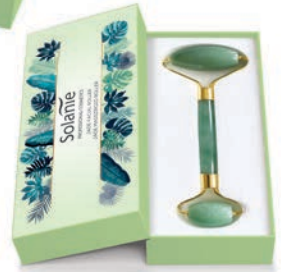
SOLANIE JADE FACIAL ROLLER SO25050