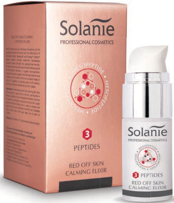
RED OFF SKIN CALMING 3 PEPTIDES ELIXIR