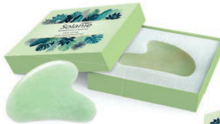
SOLANIE GUA SHA JADE MASSAGE STONE SO25049