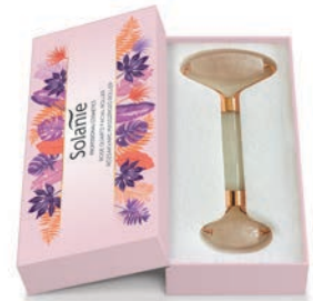
SOLANIE ROSE QUARTZ FACIAL ROLLER SO25052