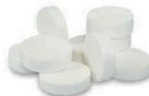
SOLANIE COMPRESSED FACIAL MASK TABLETS 10 PCS SO250020