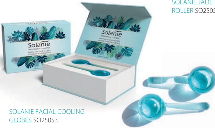
SOLANIE FACIAL COOLING GLOBES SO25053