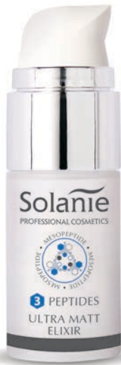
ULTRA MATT 3 PEPTIDES ELIXIR