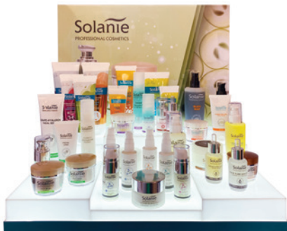
SOLANIE DISPLAY SO90002