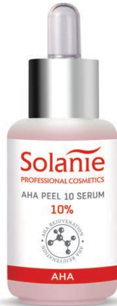
AHA PEEL 10 SERUM

0% | Paraben Mineral oil Silicone oil Perfume Colorant