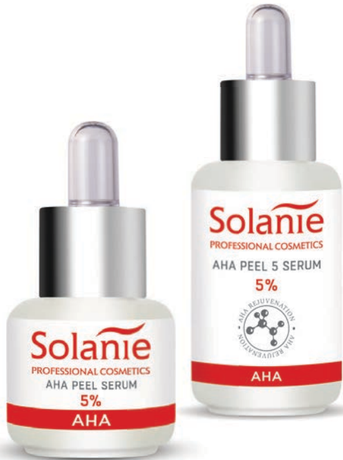
AHA PEEL 5 SERUM