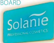
SOLANIE LUMINOUS BOARD (96X56X70 cm) SO250014