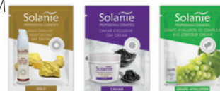
SOLANIE PRODUCT SAMPLES FROM SO10106M