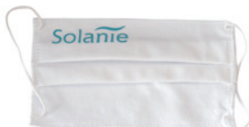
SOLANIE COTTON FACE MASK SO250019