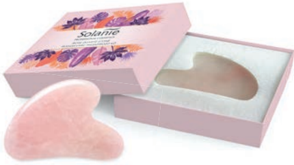
SOLANIE GUA SHA ROSE QUARTZ MASSAGE STONE SO25051