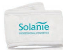
SOLANIE COTTON HAIR BAND SO250011